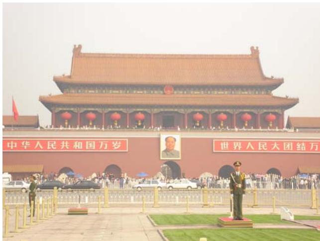
Tiananmen Gate as seen from Tiananmen Square in Beijing, 2006

Many rural believers in the registered churches live very simply and cannot afford to buy a Bible for themselves. These dramatic pictures show the joy radiating from Chinese believers when they receive their very own Bible! World Changer Kids is teaming up with Voice of China and Asia to provide and distribute Bibles to Chinese believers this July. Each Bible costs only five dollars. If you would like to help, please contact Voice of China and Asia ( www.vocamissions.com ) or World Changer Kids ( www.worldchangerkids.org ). Pray for Windee World and the VOCA team in China this July! Help Windee World water the “seed” she planted in China 5 years ago!